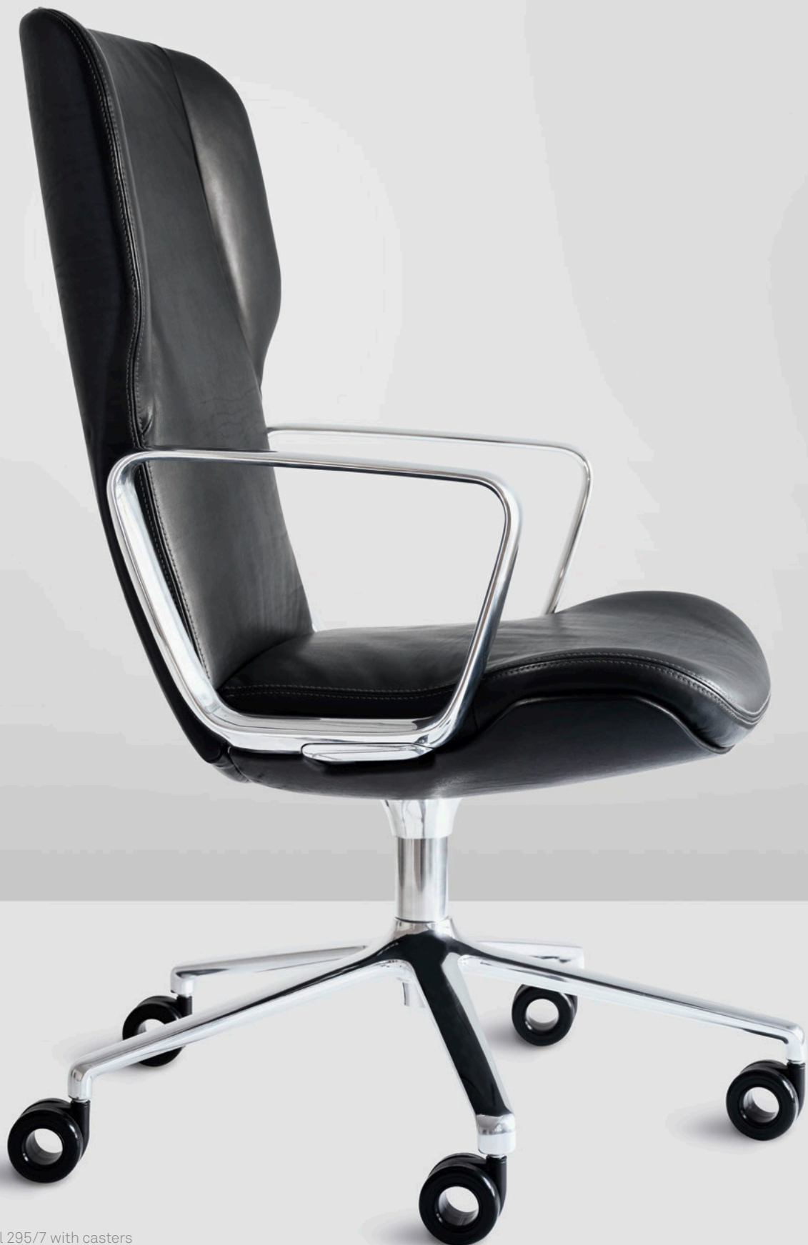
Model 295/7 with casters