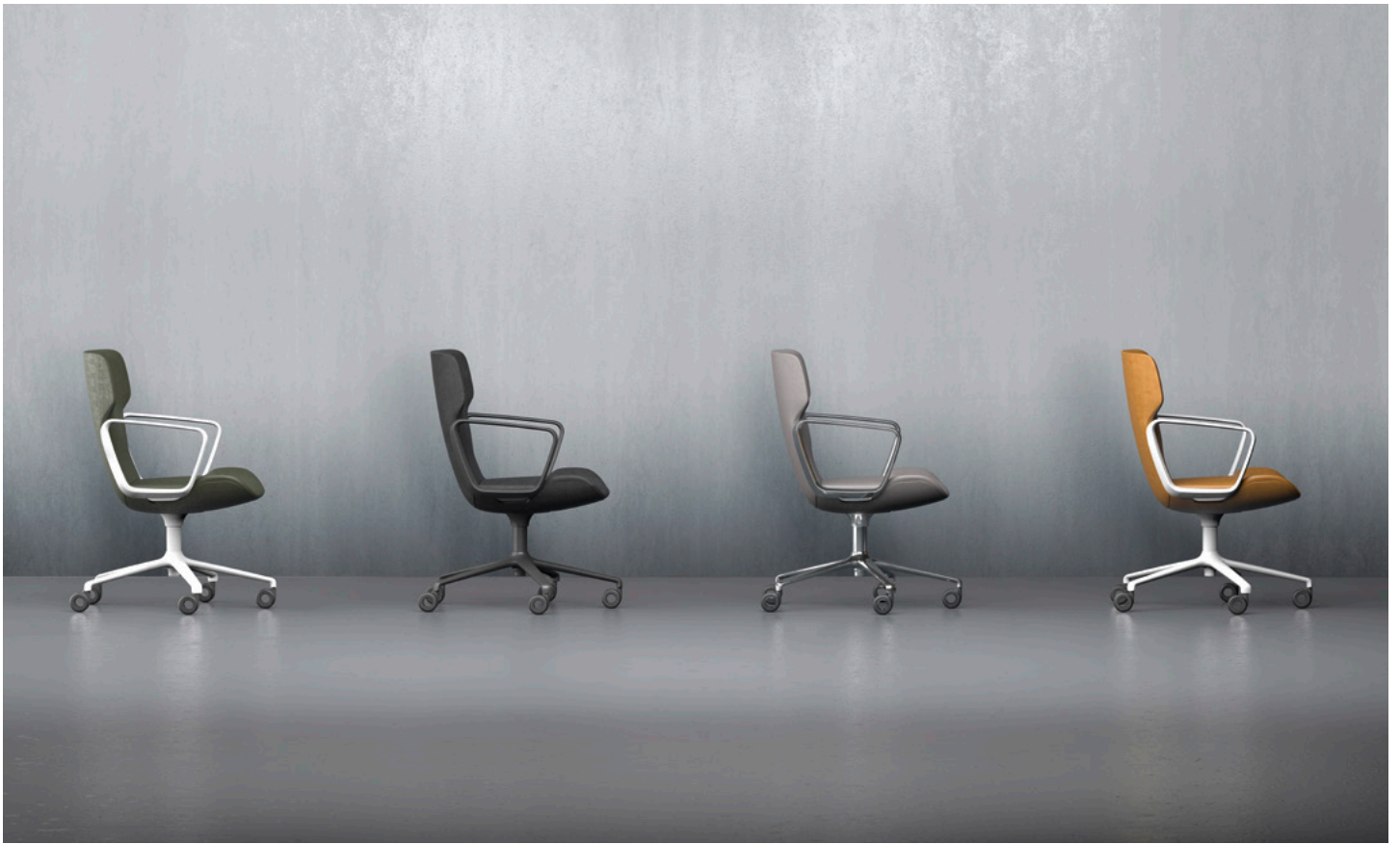
Upholstery materials and frame surfaces can be combined as desired to respond to all sorts of design concepts. The chair always looks different but its form is the common denominator throughout.